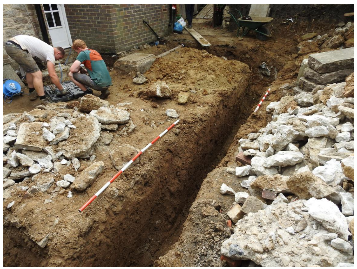
Plate 4. View of the extension foundation (looking SE)