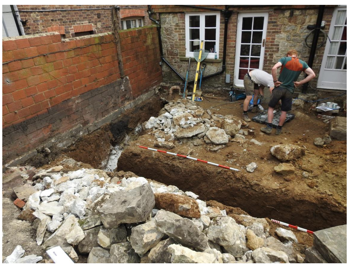
Plate 6. Foundation trench (looking SE)