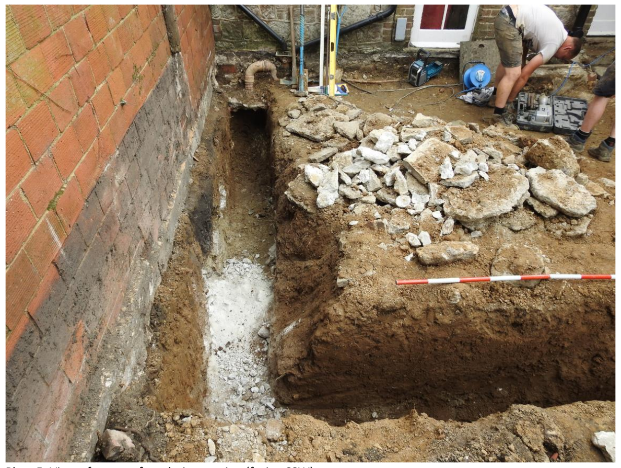
Plate 5. View of eastern foundation section (facing SSW)