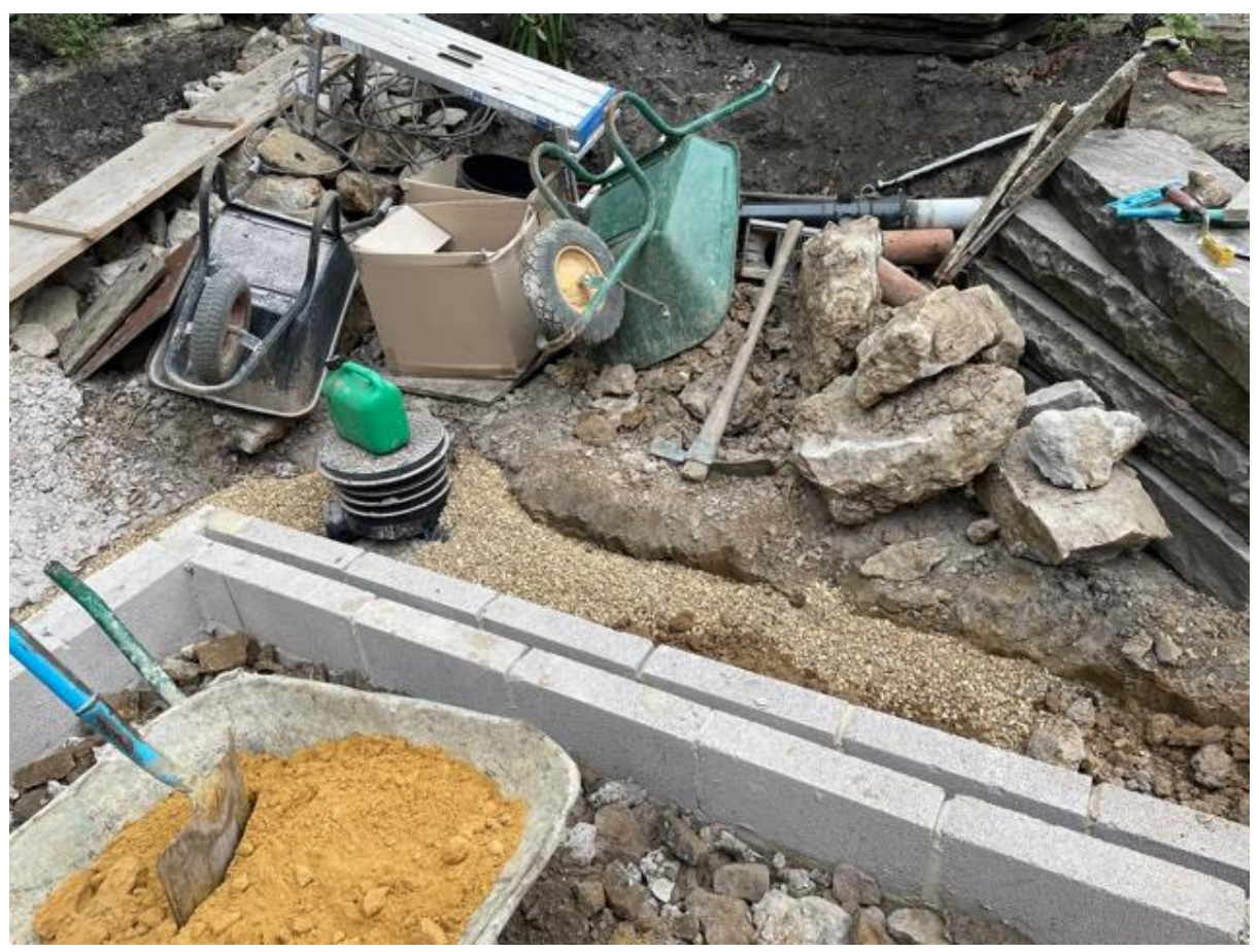
Plate 8: drainage works. (facing E)