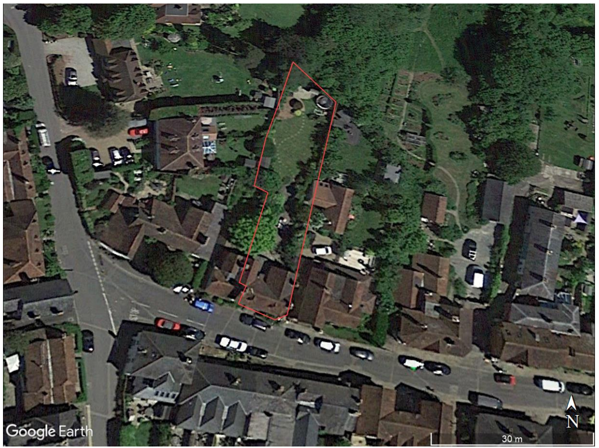
AP 1. View of site 2021 (Google Earth)