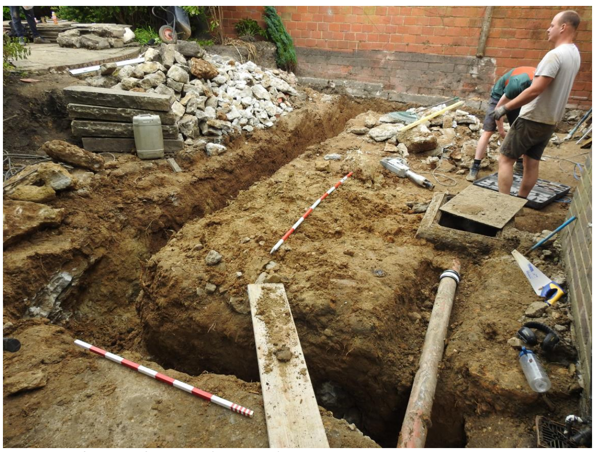
Plate 3. View of extension foundations (looking ENE)