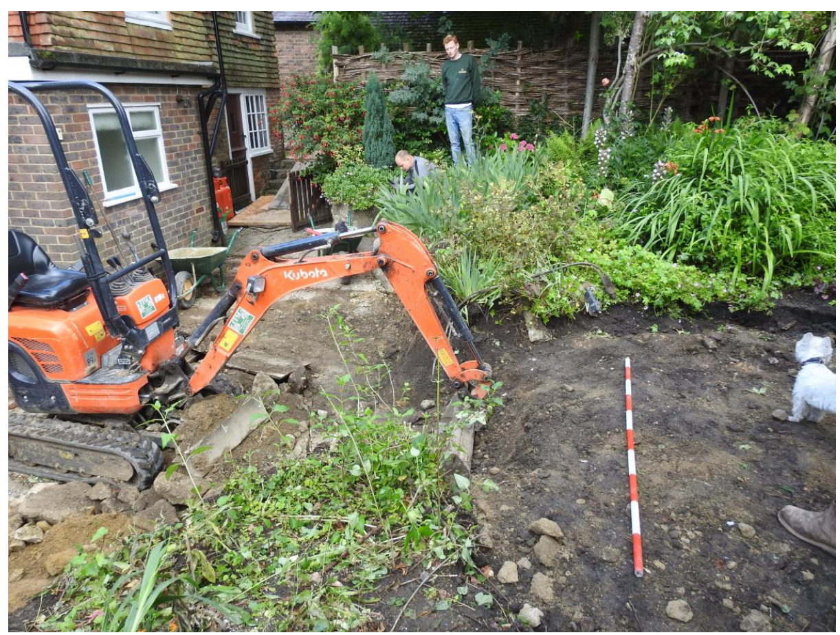
Plate 1. View of the site after Phase 1, clearance of the topsoil (looking NW)