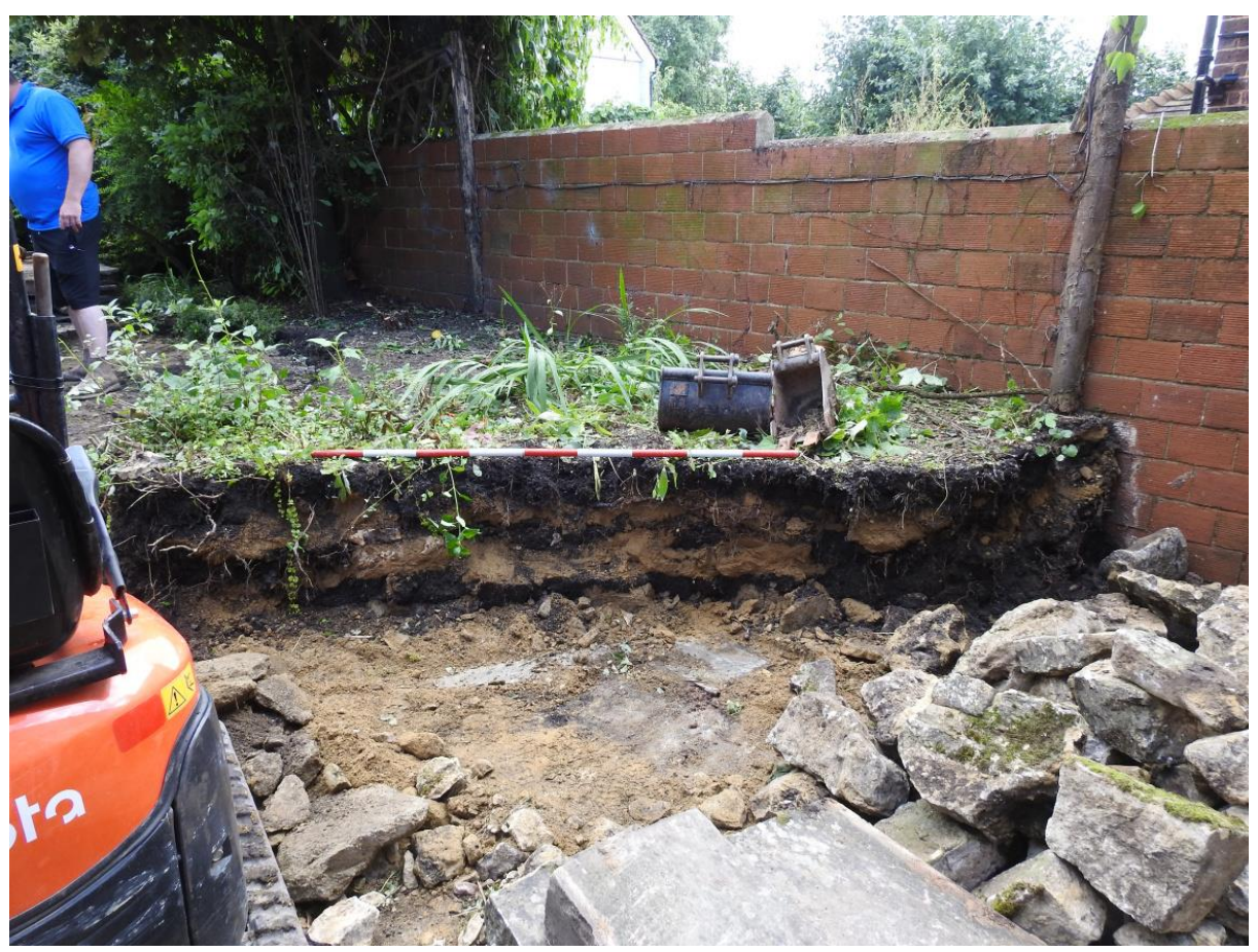
Plate 2. View of the section (looking NE)