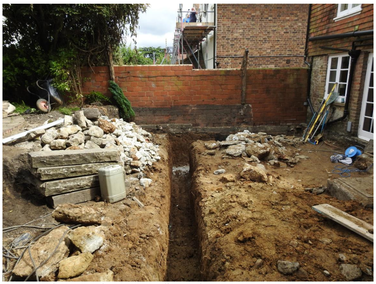
Plate 7. View of the northern foundation trench (facing ESE)