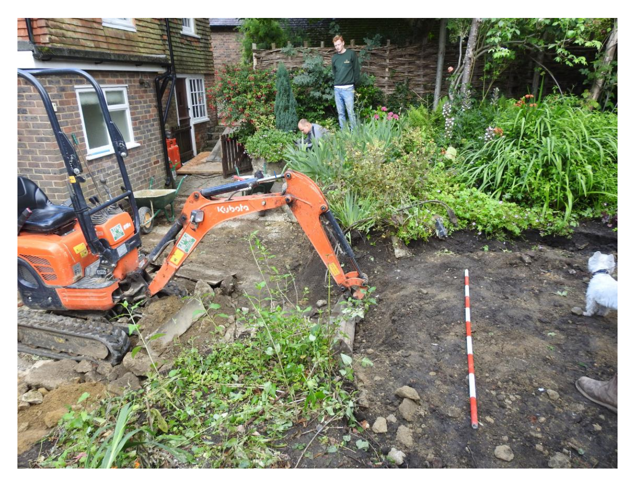
View 1. View of site of the area for foundations of the extension